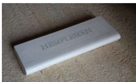
ABOVE: The new safety coping from Global Resins is not only safer for pools but has the potential to be used to promote brands – that even light up in the dark.

The new style of coping may be lightweight but it packs a punch. It is made from similar materials used in the challenging environments around deep sea oil rigs.